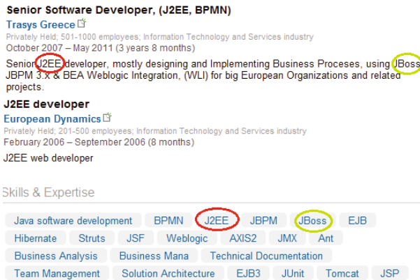
Fig. 3. LinkedIn skills example

For those candidates that were found to have the necessary skills a second search is conducted to determine whether one or more of the candidate’s past work experience belongs to the same domain of expertise as the job position of interest. The algorithm applied for this purpose can be briefly described as follows: Let S1 be the skills corresponding to a past job position E1 as stated in the work experience section (title or description text) of the respective LinkedIn profile. Also, let S be the skills required by the current job position, corresponding to the job position domain and may be found at any level of the hierarchy. If there is an overlap between S and S1 ( S \cap S1 \neq \emptyset ), the past job position E1 is regarded as relevant and thus is taken into account in the relevant job experience calculations.